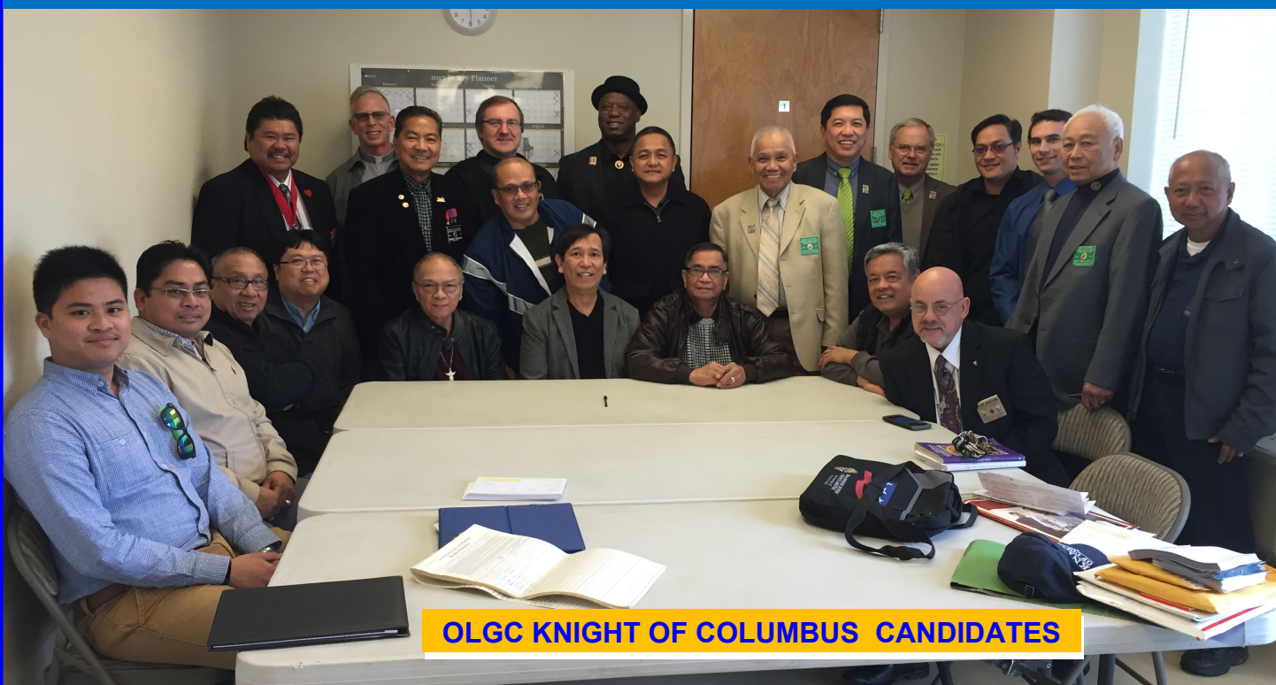
OLGC KNIGHT OF COLUMBUS CANDIDATES