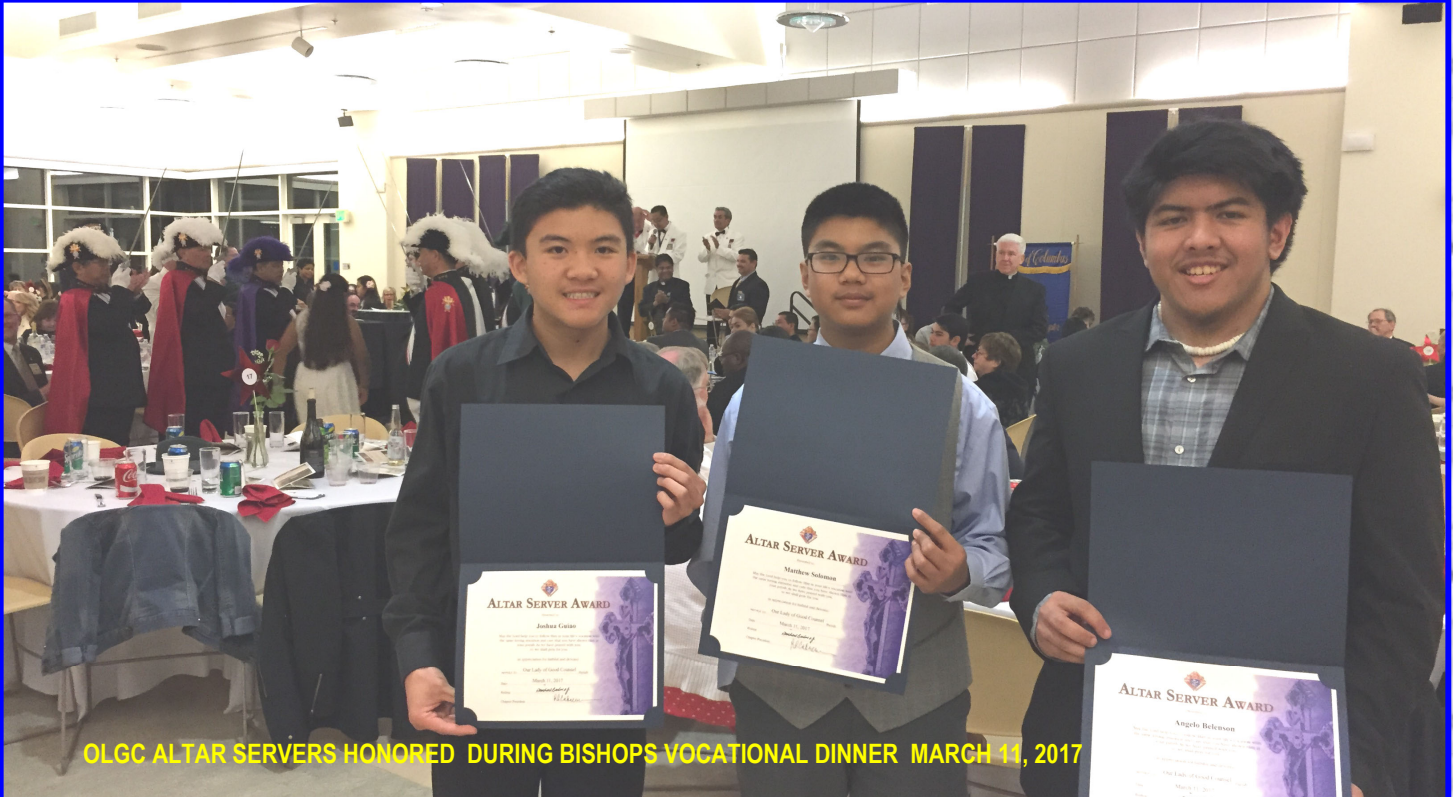
OLGC ALTAR SERVERS HONORED DURING BISHOPS VOCATIONAL DINNER MARCH 11, 2017