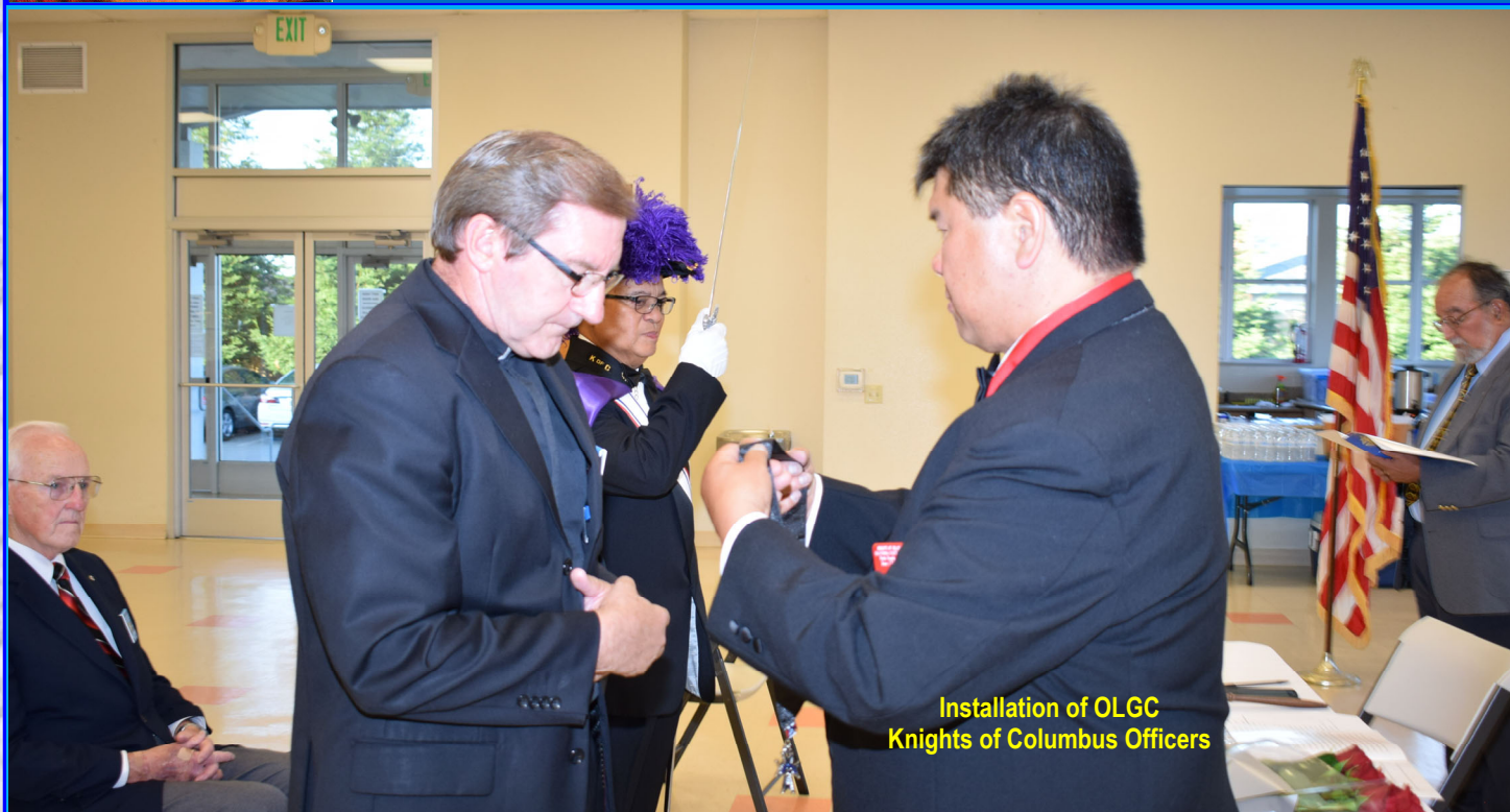
Installation of OLGC Knights of Columbus Officers