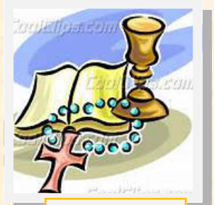
Catholic Answers 29

Q. Can we surely benefit on Buddhist style meditation ? They say that a catholic should not meditate in a buddhist sense, because it brings us closer to ourselves, and not to God and others. How can you get to know and love others if you don't know and love yourself? I'm not talking about worshipping any false idols, such as buddha, simply the meditation of focusing purely on the self.