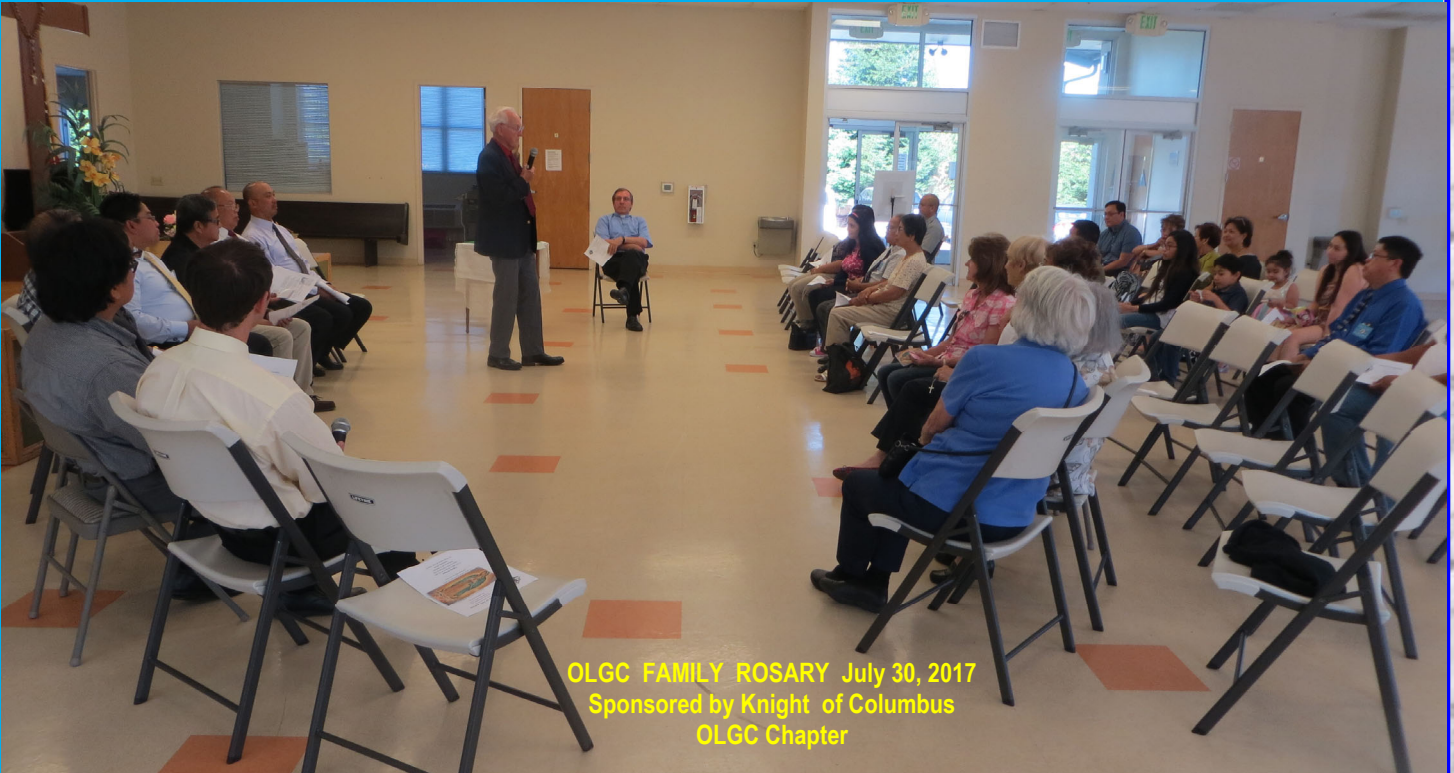
OLGC FAMILY ROSARY July 30, 2017 Sponsored by Knight of Columbus OLGC Chapter