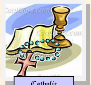
Catholic Answers 29

Q. I was raised in a Pentecostal home, but I am a very recent convert to the Catholic faith (I was baptized this past Easter).