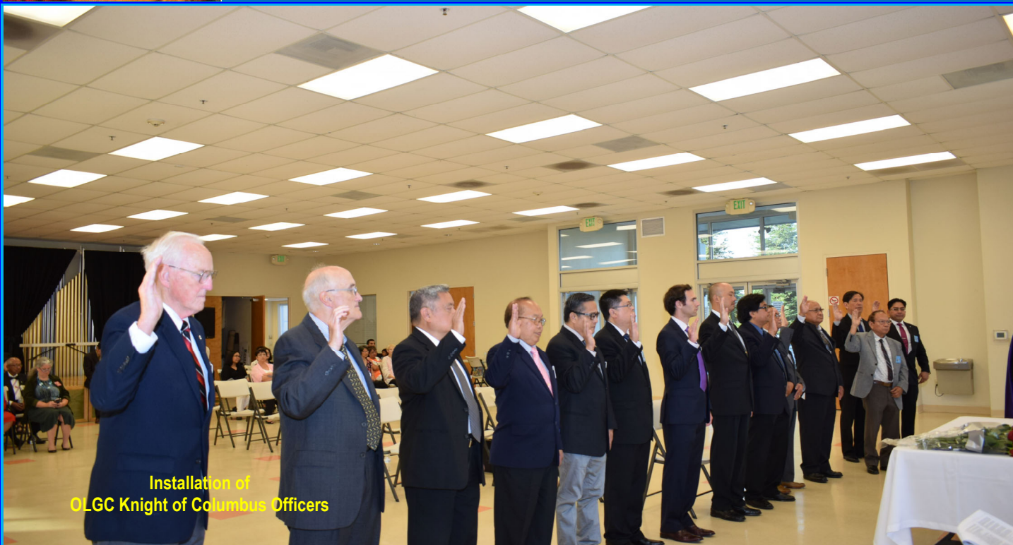
Installation of OLGC Knight of Columbus Officers