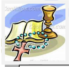
Catholic Answers 29

They say that a catholic should not meditate in a Buddhist sense, because it brings us closer to ourselves, and not to God and others. We are made in the image of God, however, so surely the best way to get to know God is to know ourselves. By centralizing the mind on the self, we must be able to learn a thing or two about God. Surely in meditation, when we are purely focused in on ourselves, God can easily inspire us and guide us by creating desires within us, without us even realizing .