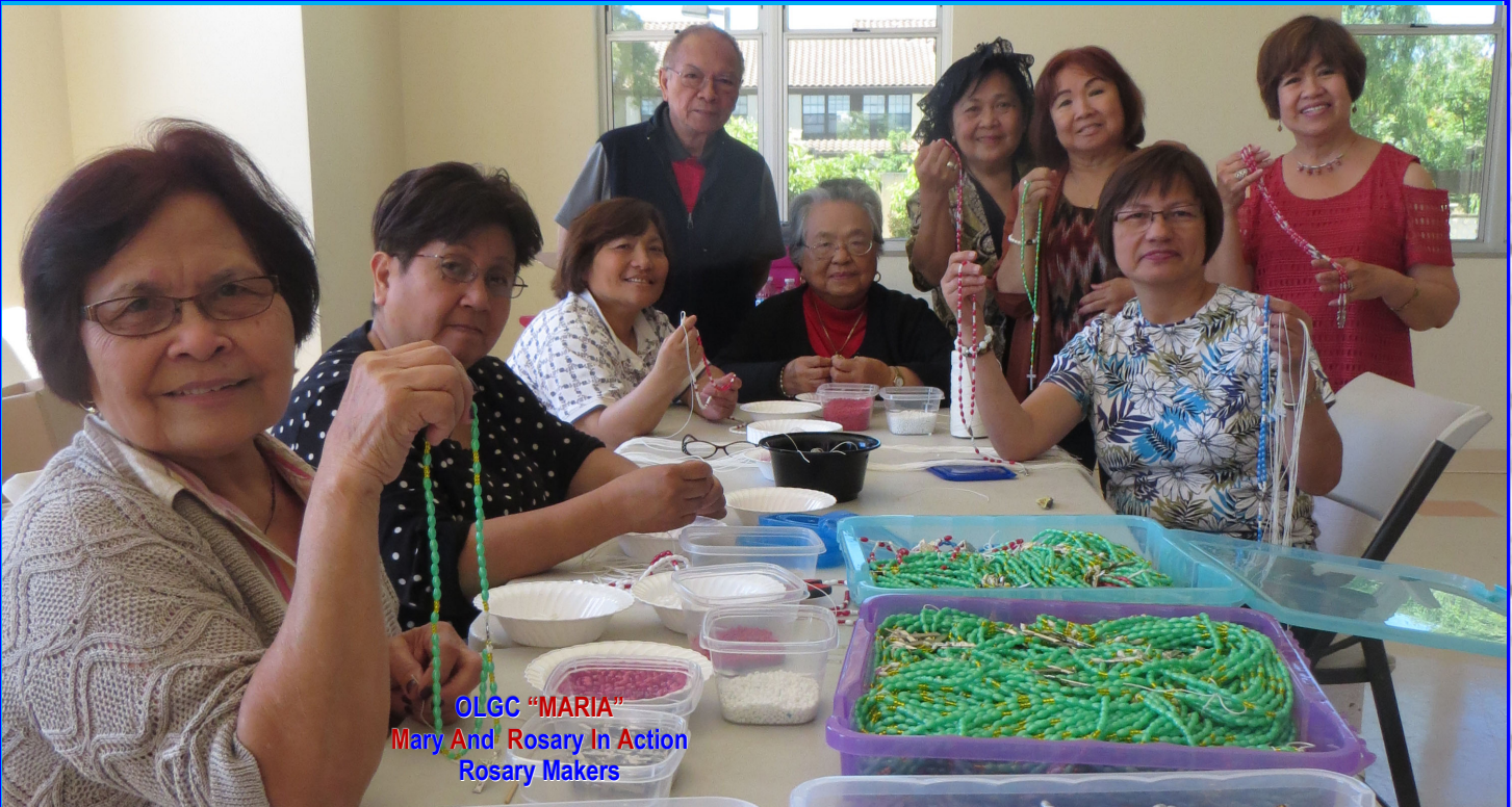
OLGC "MARIA" Mary And Rosary In Action Rosary Makers