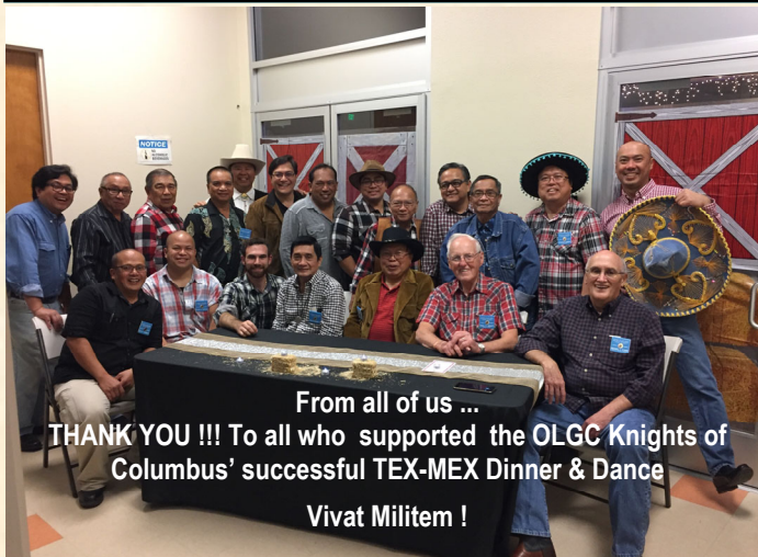
From all of us ... THANK YOU !!! To all who supported the OLGC Knights of Columbus' successful TEX-MEX Dinner & Dance Vivat Militem !