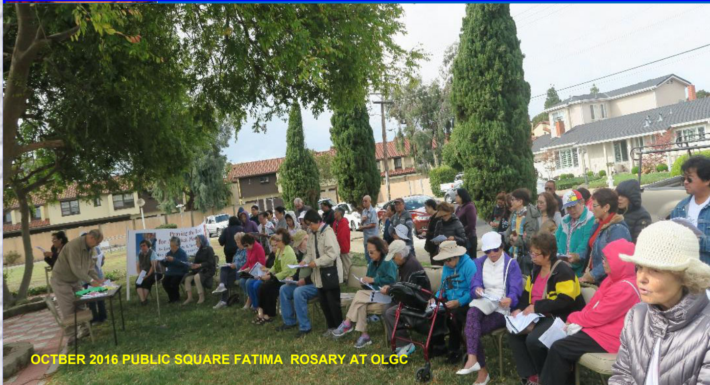
OCTOBER 2016 PUBLIC SQUARE FATIMA ROSARY AT OLGCC