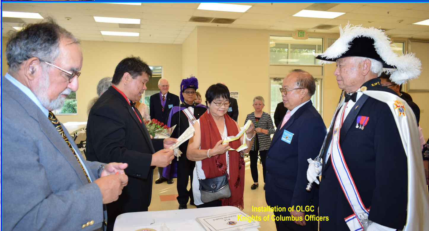
Installation of OLG Knights of Columbus Officers