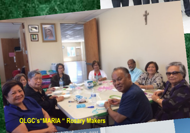
OLGC's "MARIA" Rosary Makers