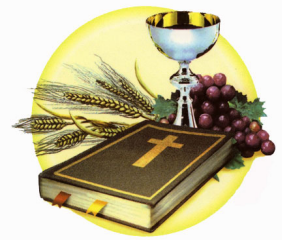
Catholic Answers APO 9

Q. Protestant say that a cross is not the same as a crucifix. I was told also that a cross represents that Jesus has risen and is proper to wear.