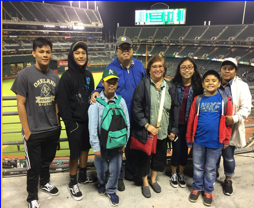
OLGC Altar Servers at the Oakland Ballgame