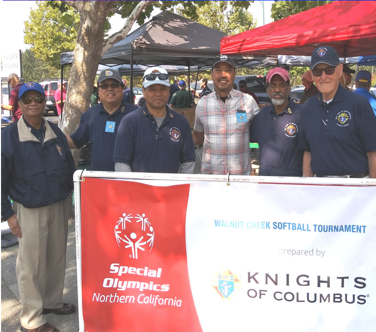
OLGC KNIGHTS OF COLUMBUS HELPING THE SPECIAL OLYMPIC TOURNAMENT IN WALNUT CREEK