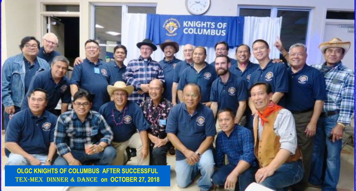
OLGC KNIGHTS OF COLUMBUS AFTER SUCCESSFUL TEX-MEX DINNER & DANCE on OCTOBER 27, 2018