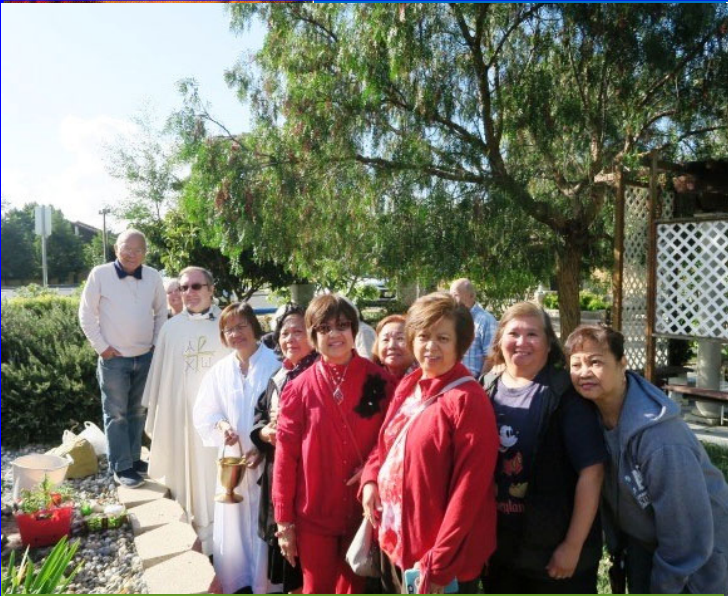
Tree Planting at the Grotto In memory of Kathi Ippolito